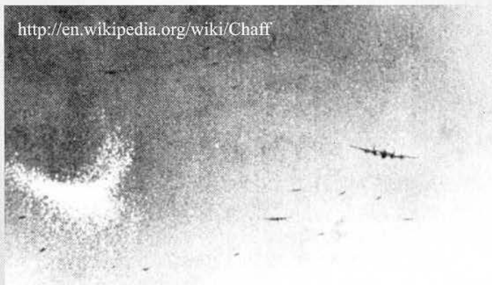
An Avro Lancaster dropping Window (the crescent-shaped white cloud on the left of the picture) from within the accompanying bomber stream.